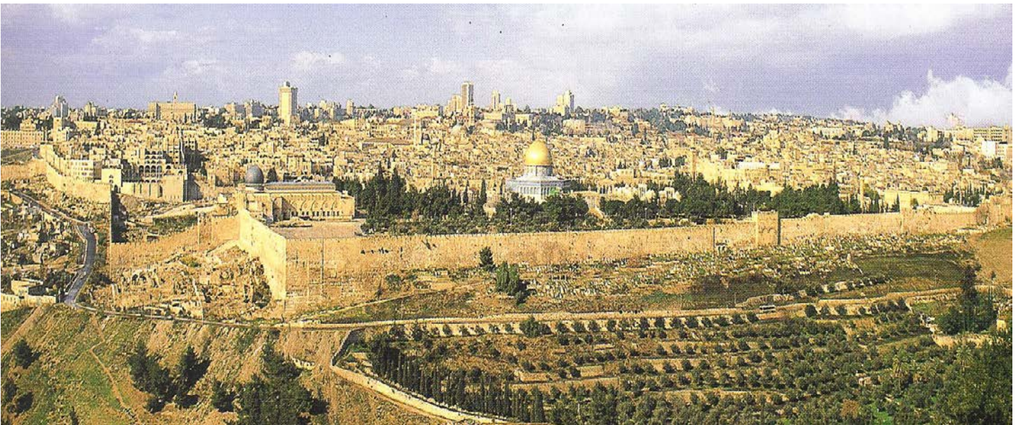
A view of Jerusalem as seen from the Mount of Olives